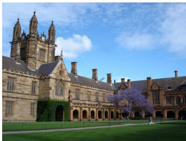
For use by Compass Career News Subscribers only