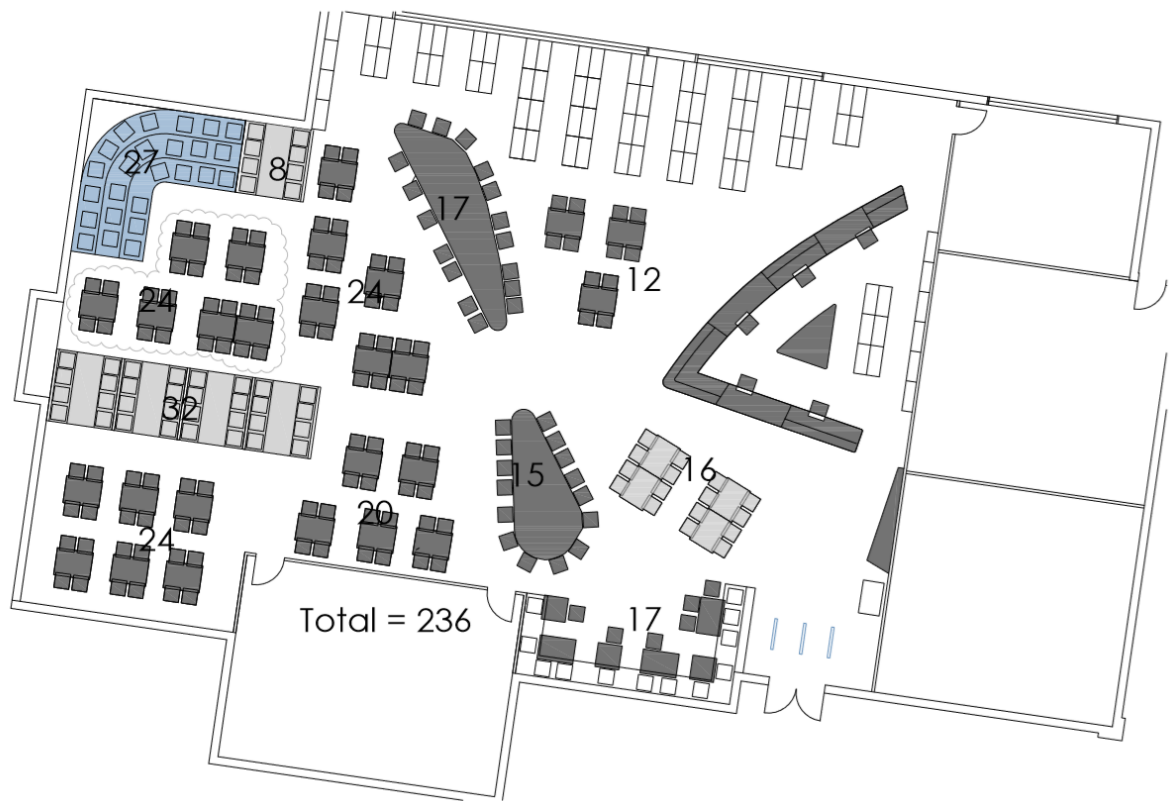
Student Congestion in the Library Foyer