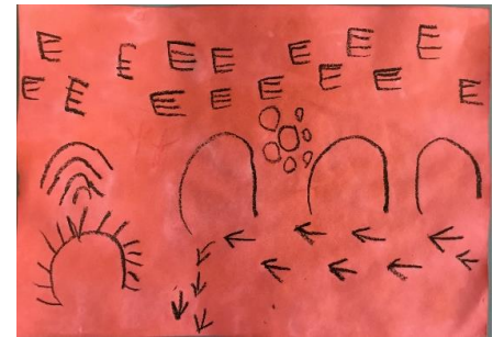
Animal tracks, cloud, emu tracks, a star, three humans and a human print.