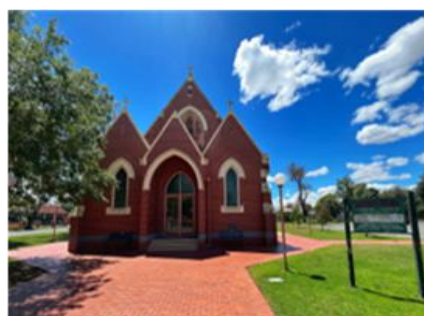
Sacred Heart, Yarrowonga Cnr Murphy & Witt Streets PO Box 36, Yarrowonga Vic 3730