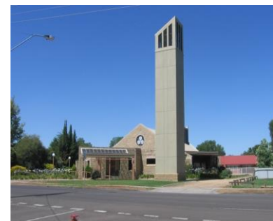
St Joseph's Cobram 6-8 William Street PO Box 424 Cobram, Vic 3644

Yarrowonga & Cobram Catholic Parishes are Child-Safe Organizations: We are committed to National Catholic Safeguarding Standards. With the Diocese of Sandhurst, we commit to provide "a safe and supportive environment for all persons, especially children, young people and adults at risk and has a zero tolerance of abuse."