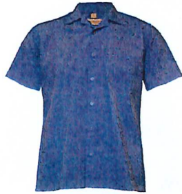
Shirt Short Sleeve Blue