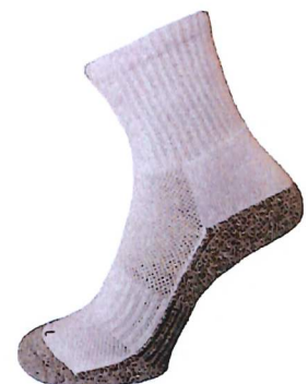
Sport Sock 2 pkt

For current prices, please refer to www.bobstewart.com.au