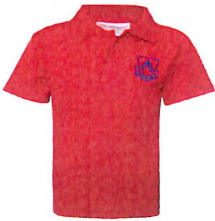
Sports Polo S/S