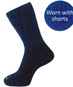
Sock Crew Navy 2pk

For current prices, please refer to www.bobstewart.com.au