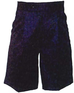
Shorts Fly Front Navy