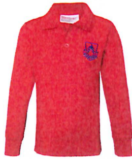
Sports Polo L/S