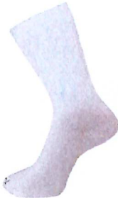
Sock Anklet White 2 pkt