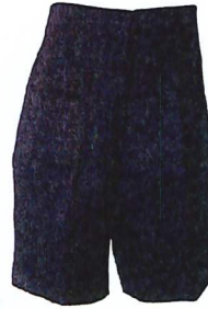
Shorts Elastic Back Navy