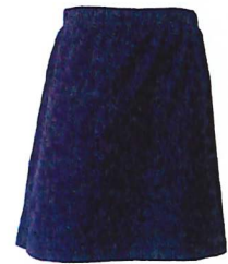
Sports Skort Navy