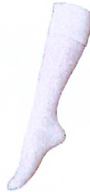
Knee High White 2 pkt