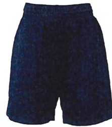
Sports Shorts Navy