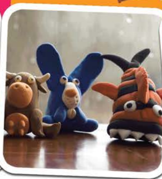
Aliens from Space