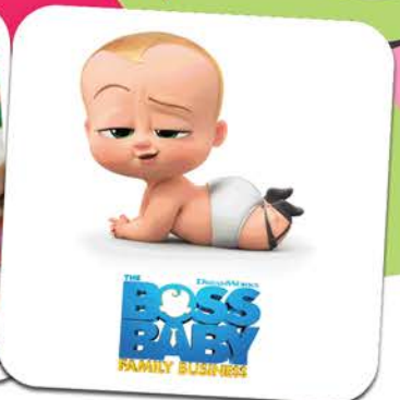
At the Movies