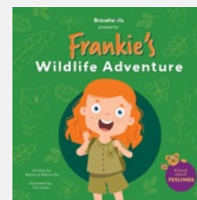
Frankie's Wildlife Adventure: A Book About Feelings