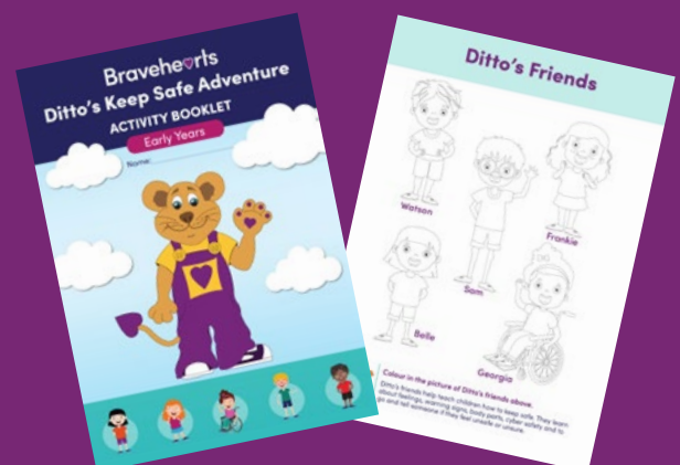
Each child will receive an activity booklet which is full of fun and engaging activities.