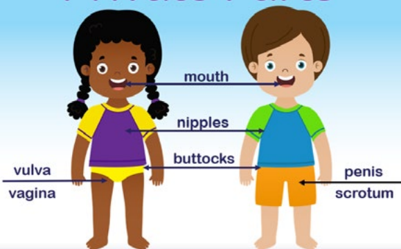
An example of how private parts are presented in the Lower Primary Show.