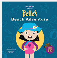
Belle's Beach Adventure: A Book About Body Parts