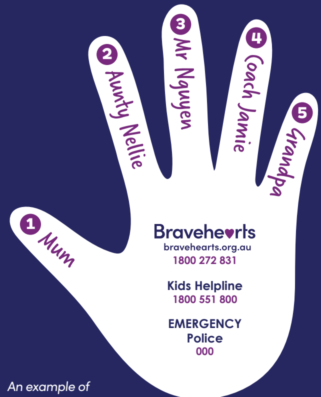
An example of a safety team.

A safety team consists of adults that the child can trust. An adult that believes them, listens to them and wants to help. These should be adults both inside and outside of your family that the child can go to if they ever feel unsafe or unsure.