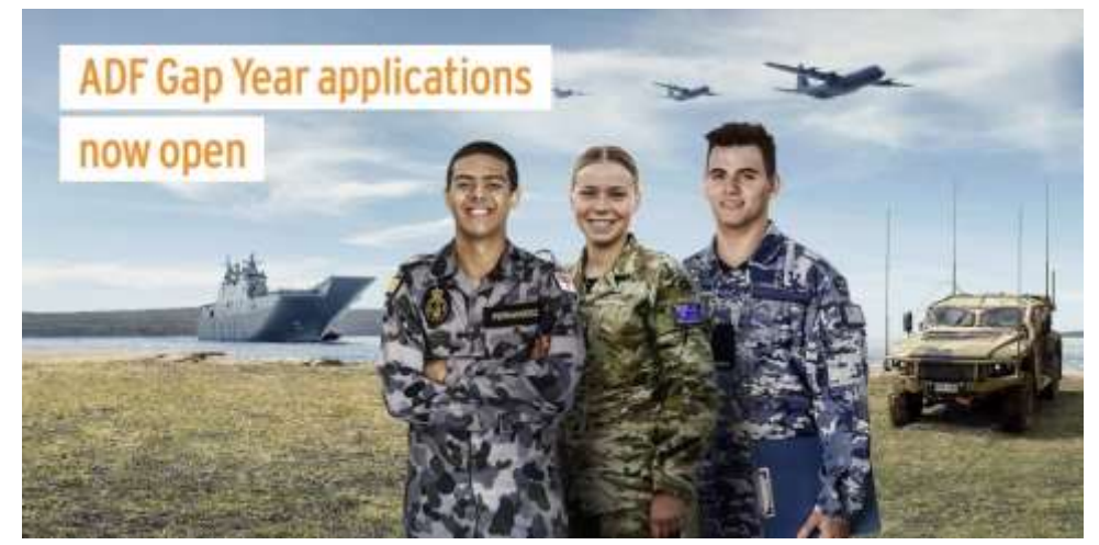
Discover your path with an ADF Gap Year

An ADF Gap Year is a unique opportunity to experience life in the Navy, Army or Air Force, for only a 12-month commitment.