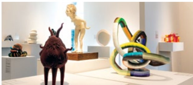
Installation image of the 2024 Deakin University Contemporary Small Sculpture Award, 2024, photography Fiona Hamilton. image © copyright and courtesy of the artists