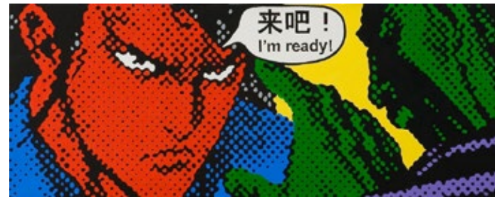
Song Ling, Kong Fu - Our dream 1 2007 acrylic on canvas. Purchase, 2008. Deakin University Art Collection image © copyright and courtesy of the artist and Niagara Galleries, Melbourne (Face to Face Revisited exhibition)