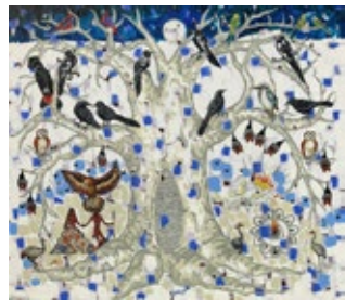
Deanne Gilson, Karingalabil Bundjil Murrup, Manna Gum Tree (The Creation Tree of Knowledge) 2020 , ochre and acrylic on linen, 90 x 100 x 3cm, Deakin University Art Collection. Purchase, 2021, image © copyright and courtesy of the artist (50 Years of Collecting exhibition)