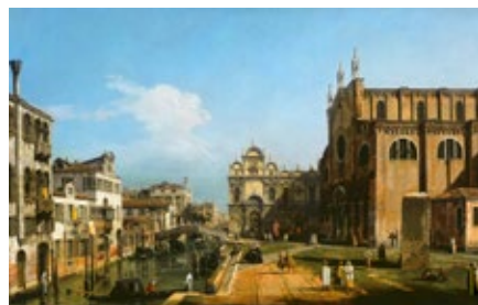
Bernardo Bellotto, The Campo di SS. Giovanni e Paolo, Venice, 1743/1747 , oil on canvas. Promotional image only provided by Curators of the Venetian Bind exhibition. Image in the public domain, Courtesy National Gallery of Art, Washington (Venetian Bind exhibition)