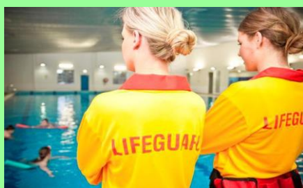
Sport and Recreation Traineeship - Aquatic