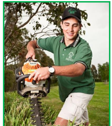
Horticulture – Parks and Gardens Apprenticeship

For more information on our current vacancies please go to: