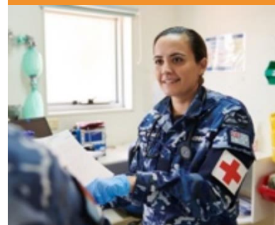
Healthcare, Science & Chaplaincy