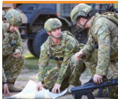
Officers & Management