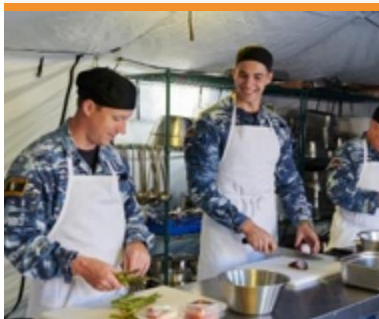
Logistics, Hospitality & Support