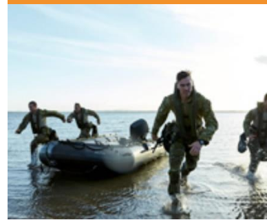
Combat & Security