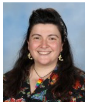
LISA Year 8 8J1, 8J2, 8J3