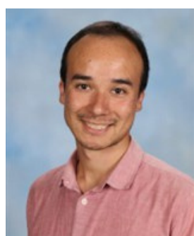
BRENT Year 10 10T1, 10T2, 10T3, 10C1