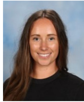
AMARINDA Year 7 7G1, 7G2, 7G3