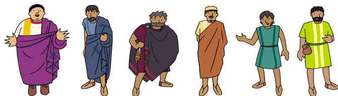
Matthew Thomas Simon Thaddaeus James Judas