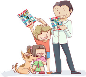
Families order from Book Club.

Every purchase you make earns your child's school 15% of your order value in Scholastic Rewards that can be used to purchase valuable educational resources that benefit your child.