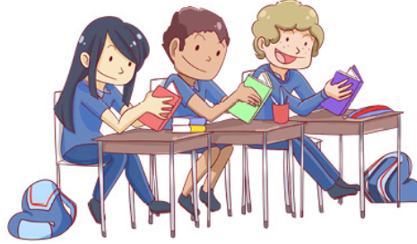
The school earns Scholastic Rewards.