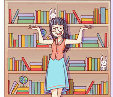
The school redeems Scholastic Rewards for additional resources