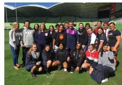
School to Work Program previous participants visit Melbourne Storm