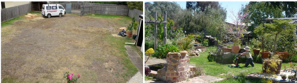
BEFORE (2008) and AFTER (2015) - A suburban backyard in Geelong

Note: This PDC is being run by Permaculture Geelong* in conjunction with Ballarat Permaculture Guild* with funding via ACFE (*Local groups of Permaculture Victoria)