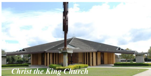
Christ the King Church