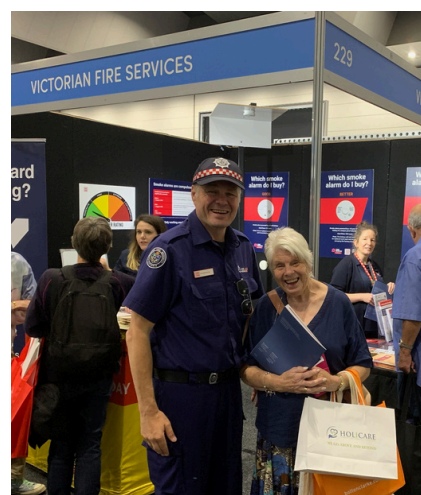
ACCPA Care and Ageing Well Expo – Melbourne, Feb 2024