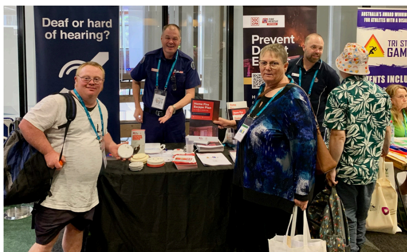
VALiD Conference and Expo – Geelong, Feb 2024