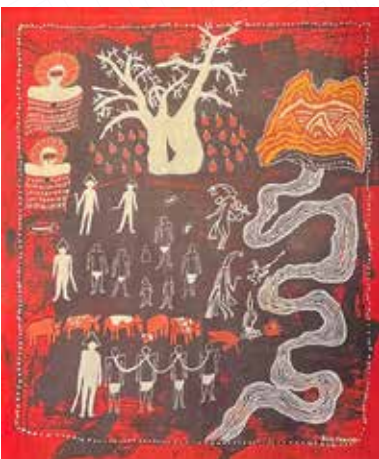
Joshua Foti ('16)