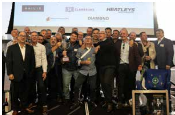
Class of 1983 winners of the Come with Strength and Vigour trophy

Four exceptional Old Boys were then inducted into the TOBA Sporting Hall of Fame.