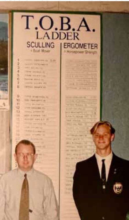
1996 TOBA Ladder