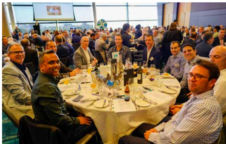
Class of 1997 and Class of 1993