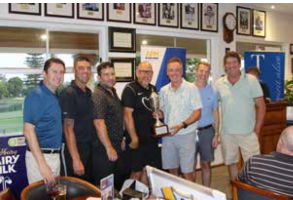
Strongest attendance at the Golf Day – Class of 1989