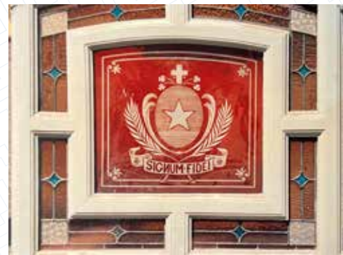
The Signum Fidei Window the day it was found