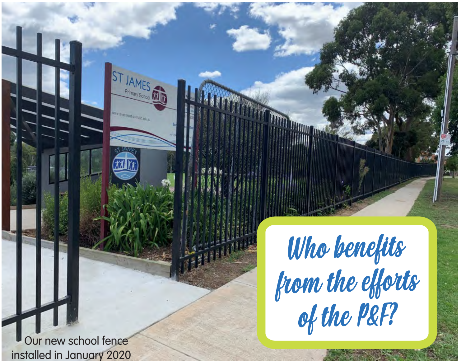
Our new school fence installed in January 2020