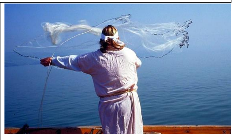
Seventeenth Week in Ordinary Time - Year A

Bookings to be made 6 months prior to wedding date. Book through Parish Office.