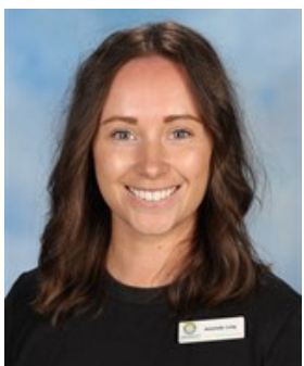
AMARINDA Head of Sub-School Year 8 8T1, 8T2, 8T3