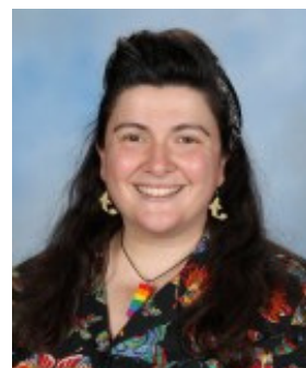
LISA Year 8 8J1, 8J2, 8J3