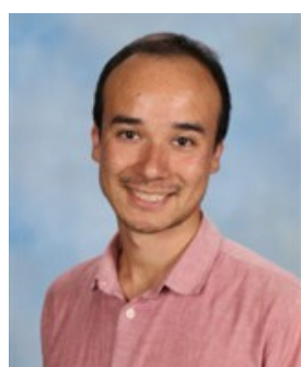
BRENT Year 10 10T1, 10T2, 10T3, 10C1