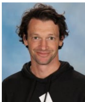
YOXFORD Year 8 8C1, 8C2, 8C3