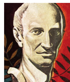
Core Classics The Tragedy of Julius Caesar by William Shakespeare

In Maths we are introducing the Cartesian Plane! It is essential that students are able to read coordinates before trying to interpret the four quadrants in the Cartesian Plane. Ask your child to locate the x and y axis of the graph, and then read the coordinate of the pineapple!