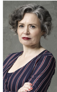
Judith Lucy Actor, Comedienne

THEATRE Rock Of Ages Hamilton The Producers Little Shop of Horrors TV Laid, It's a Date FILM Your Call is Important to Us