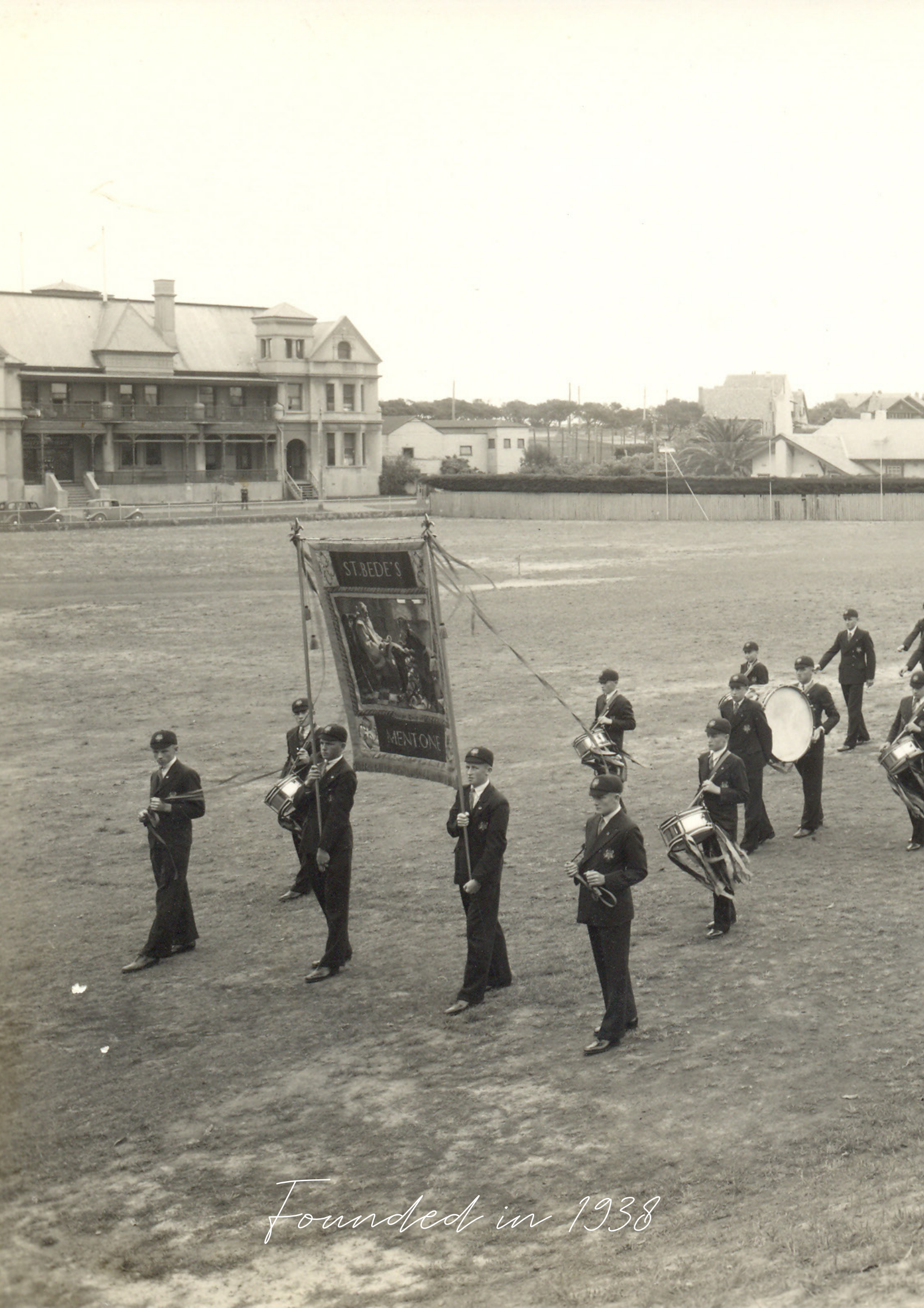
Founded in 1938