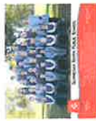
Class Photo 8"x10"