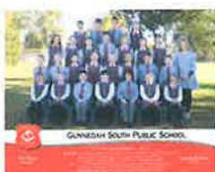
Class Photo 8"x10"