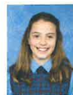
1 x (6"x8")