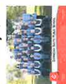
Class Only - $25