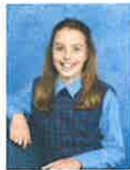
1 x (6"x8")