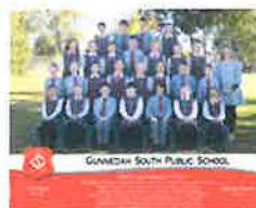
Class Photo 8"x10"