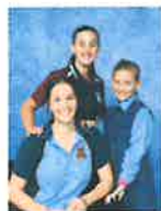
6"x8" Sibling image