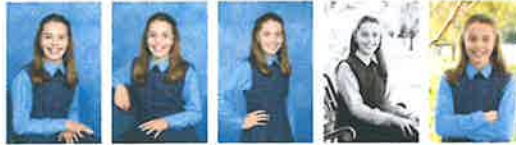
5 x (4"x6") different images