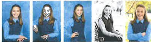
5 x (4"x6") different images