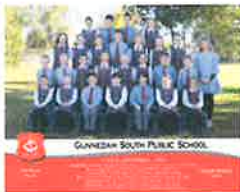
Class Photo 8"x10"