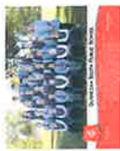
Class Photo 8"x10"