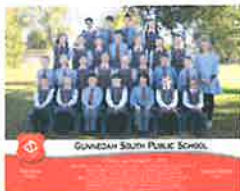
Class Photo 8"x10"