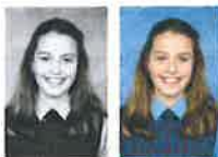
2 x (4"x6")