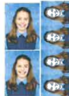
2 x (3"x4") 4 x (2"x3")