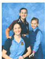
6"x8" Sibling image