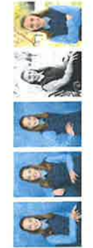
5 x (4"x6") different images