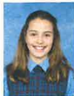
1 x (6"x8")