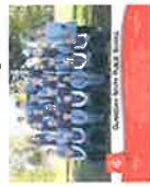
Class Photo 8"x10"