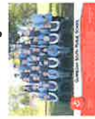
Class Photo 8"x10"