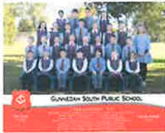
Class Photo 8"x10"