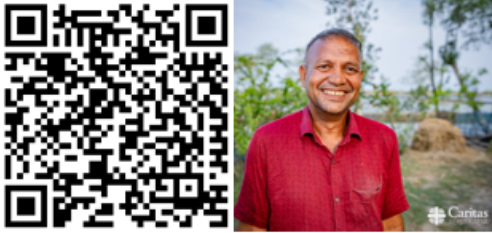
St Mary's QR Code