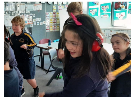
Move your body in exploratory play