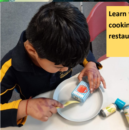
Learn to play - cooking and restaurants