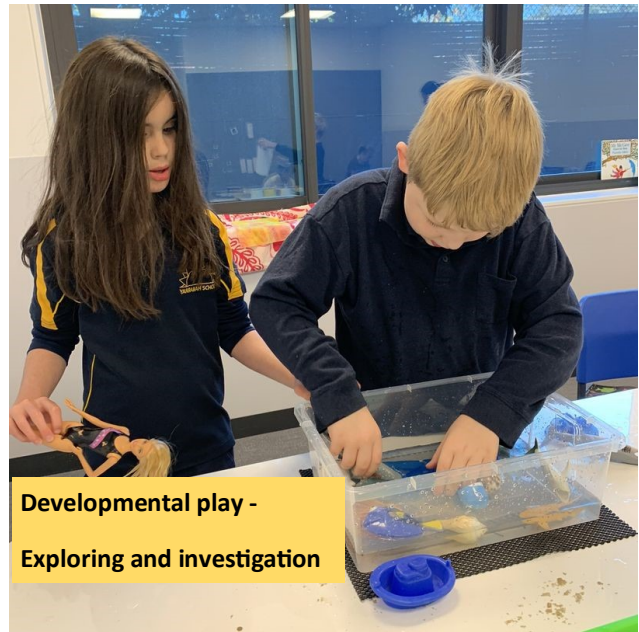
Developmental play - Exploring and investigation