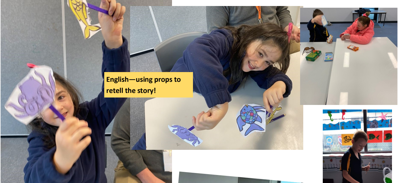
English—using props to retell the story!

Upper Juniors are still continuing with the theme under the sea. So far we have been looking at imaginary or fictional stories. This week looked at non-fiction stories. We looked at "Facts about the hermit crab" by Lisa Stratton. This term the school we are looking at is we are here to learn. We have been learning through play. Play is very important for our students to explore, investigate, put into practice what they learn. Through play students develop language, problem solving ..... In play there isn't a right or wrong answer, this further develops their confidence and willingness to give it ago!