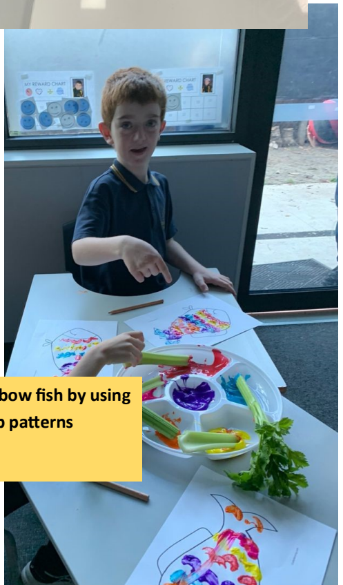
Creating a rainbow fish by using celery to stamp patterns