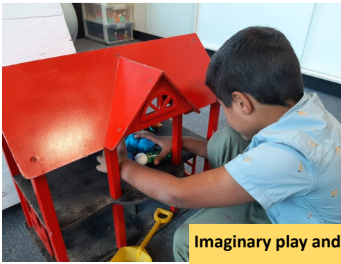
Imaginary play and learn to play