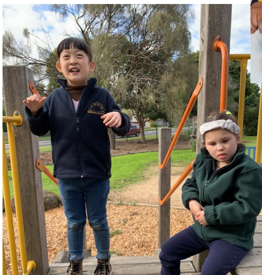
Community access—having fun together!