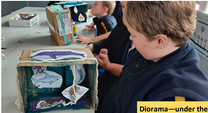
Diorama—under the sea