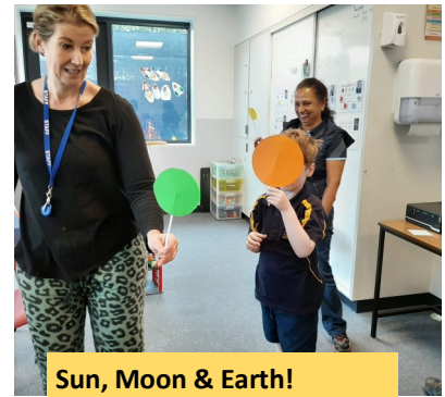
Sun, Moon & Earth!