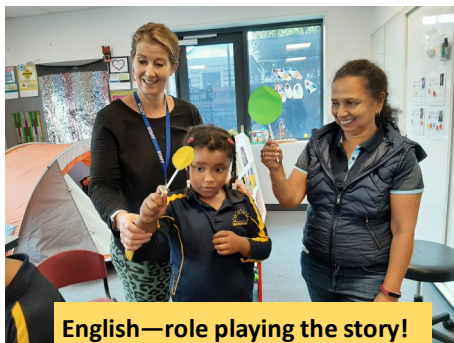
English—role playing the story!