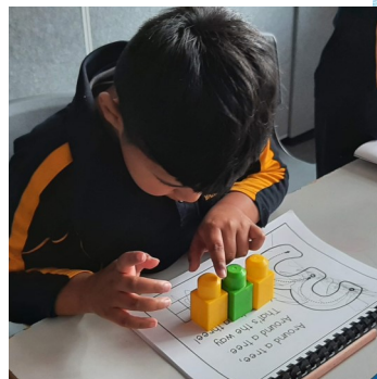
Shapes, numbers - learn to play shops