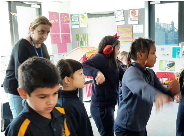
Exploratory Play—moving our body! Exploring movement .....