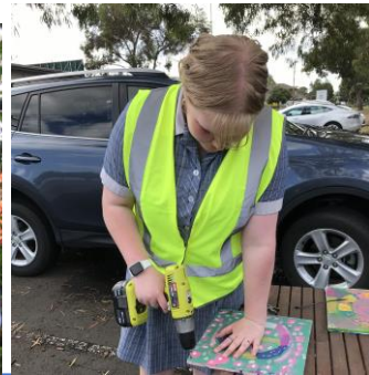
Art/Maintenance Putting up the refreshed garden signage