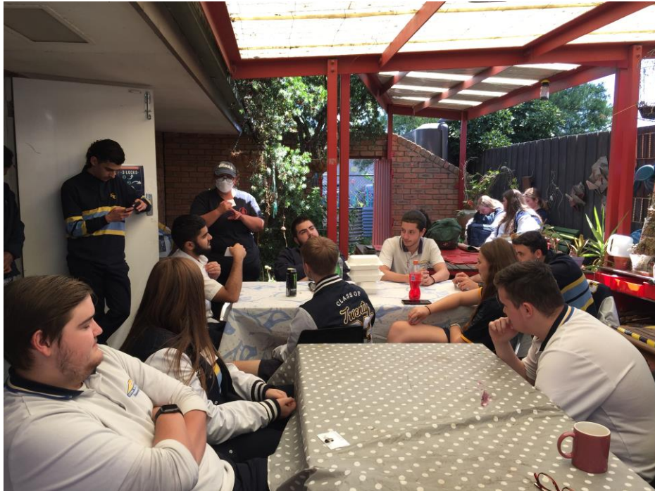
The gang this year