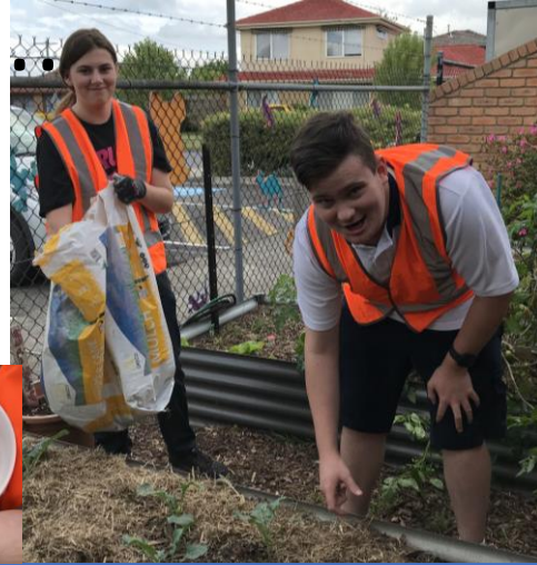
Weeders/Seeders Tucking in the vegie patch with sugar cane mulch