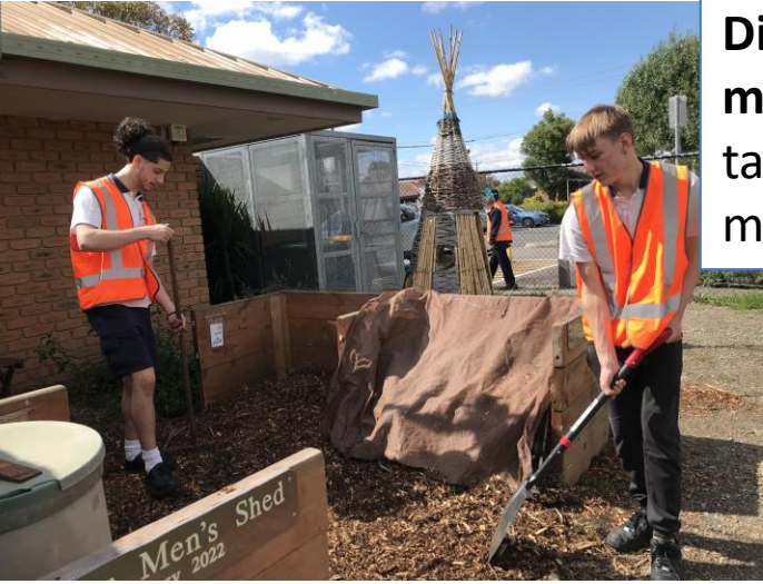
Diggers/Earth movers moving tanbark to mulch bay area