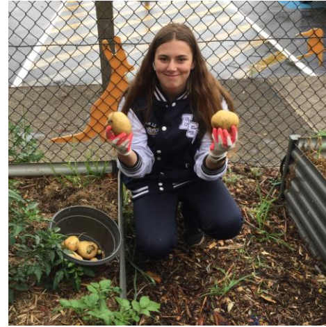
Weeders/Seeders preparing beds & harvesting potatoes; 107!