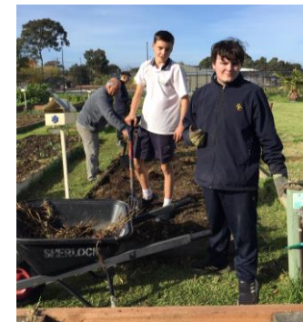
UHP @ LCG