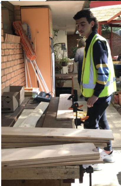
Helping prepare materials for Greenbrook Art Fiesta – Sat 1 April