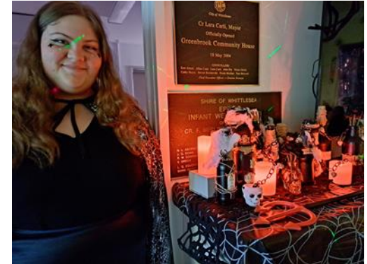
Haunted House@ GCH