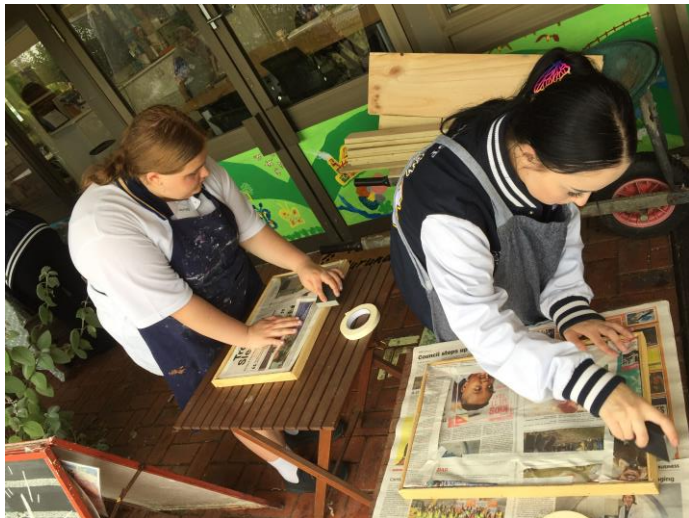
Art/Maintenance sealing timber frames around hand painted tile displays