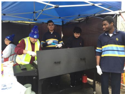
Helping with Men's Shed BBQ @ Big Freeze