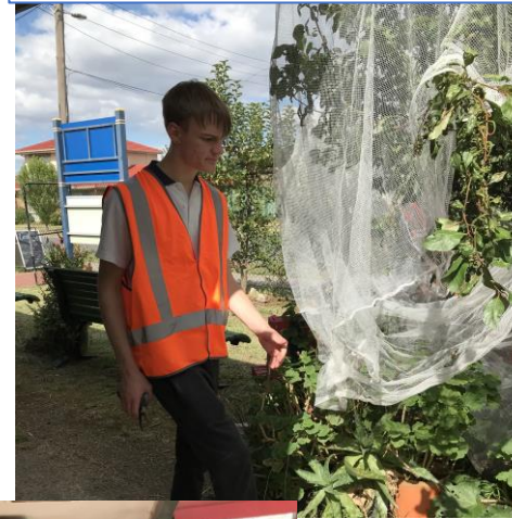
Diggers/Earth Movers Taking down fruit tree nets