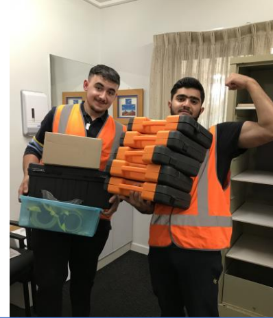
OHS crew – moving equipment to new storage cupboards