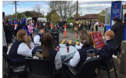
Big Freeze MC and dunking machine assistants