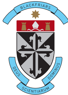
PHOTO ORDER FORM

Order must be placed by the 5th December 2018 Alternatively call Focus on (+618) 8389 9002 to order.