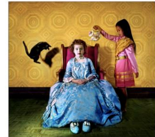
90 x 97.5 cm 1. Samantha Everton, Camellia , 2009, Editions 8, Pigment ink on rag, © Samantha Everton

Suggest art practices and working methods the artist may have used to make the artwork