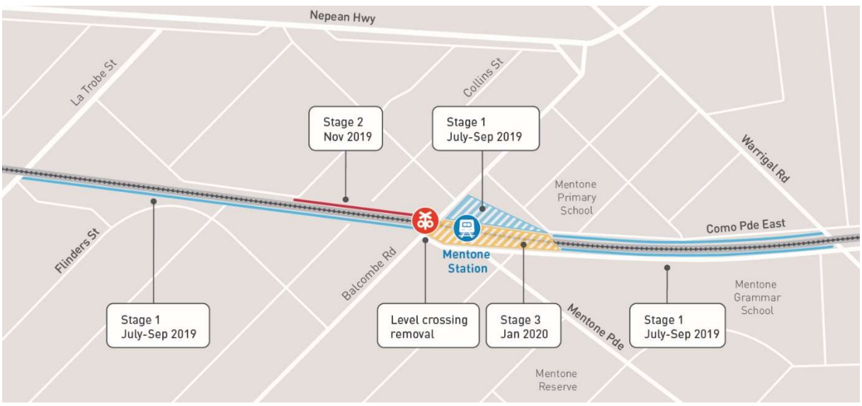
Dates may change

• Starting in late July 2019, trees and vegetation will be removed along the rail line in preparation for the level crossing removal at Balcombe Road.