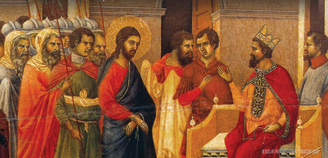
JESUS AT HEROD'S COURT | DUCCIO 1310

Our Father | Hail Mary | V Christ was obedient unto death. R. Unto death on a Cross.