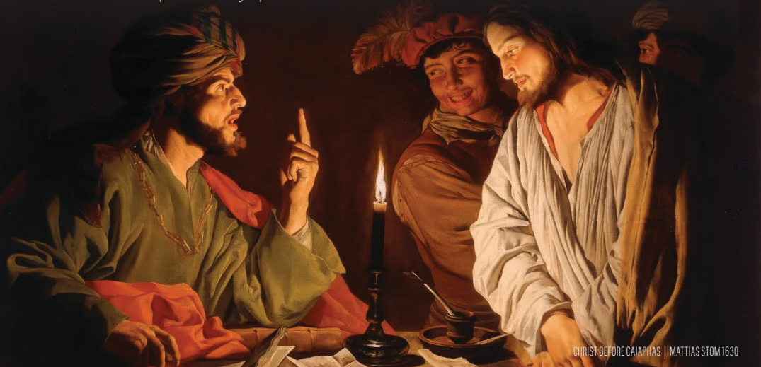
CHRIST BEFORE CAIAPHAS | MATTIAS STOM 1630

Our Father | Hail Mary | V. Christ was obedient unto death. R. Unto death on a Cross.