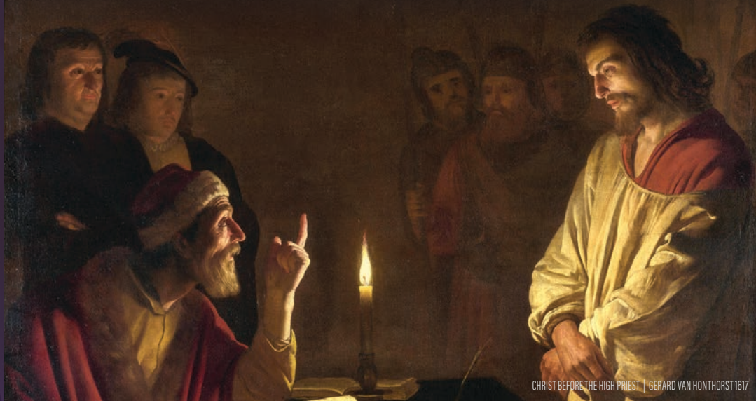
CHRIST BEFORE THE HIGH PRIEST | GERARD VAN HONTHORST 1617

Our Father | Hail Mary | V. Christ was obedient unto death. R. Unto death on a Cross.