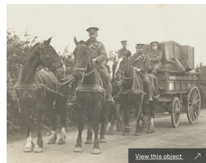
A supply waggon, 1916

It's important to understand the many parts of skilled reading for comprehension, as shown here on the Scarborough's Reading Rope. Language Comprehension is the strand that involves the understanding of spoken and written language, including the ability to make inferences and draw conclusions. Making inferences allows readers to extract meaning from texts that might not be explicitly stated. When your child reads at home, ask them some 'inferencing questions' such as, "Why did that character...." .