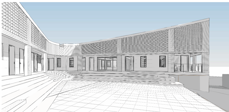
Artist impression – Rear of new Building A opening to playground (indicative only)

The department is undertaking the required planning and environmental approvals for the existing building to be demolished. It is expected that the demolition work will be finished in Term 4 2025.