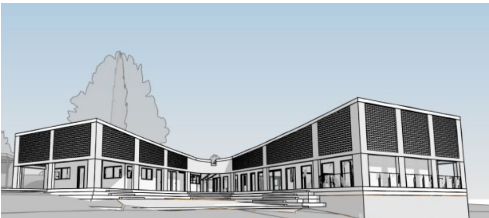
Artist impression – Front of new Building A (indicative only)

The design consultant MCA Architects, with input from school leadership, has confirmed the design of the new Building A. Artist impressions of what the new building is expected to look like can be seen below and on the next page.