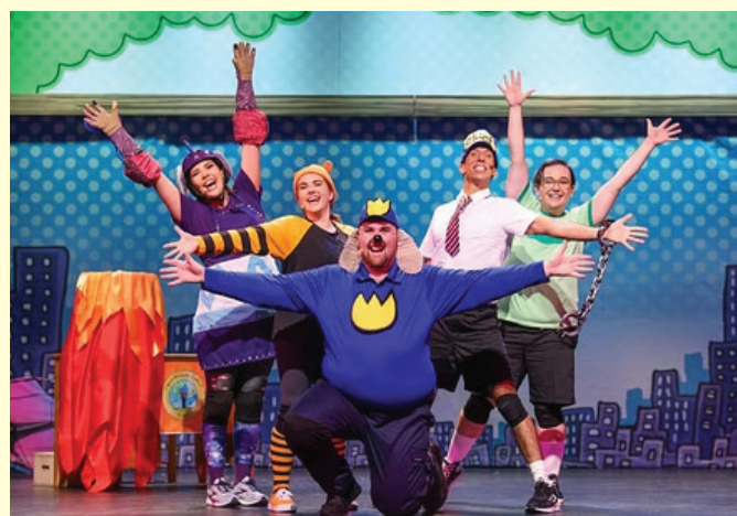
Image: The Dog Man Musical took place at the Glen Street Theatre.

they are learning about visual imagery in literacy.