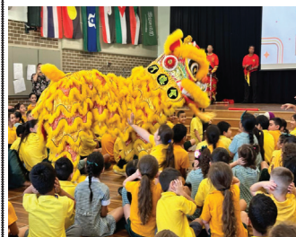
Image: The Lion Dance Kids Company perform at GEPS to celebrate the Lunar New Year.

Lunar New Year is a celebration at the beginning of the lunar calendar (lunar means moon.) It is now the Year of the Dragon.