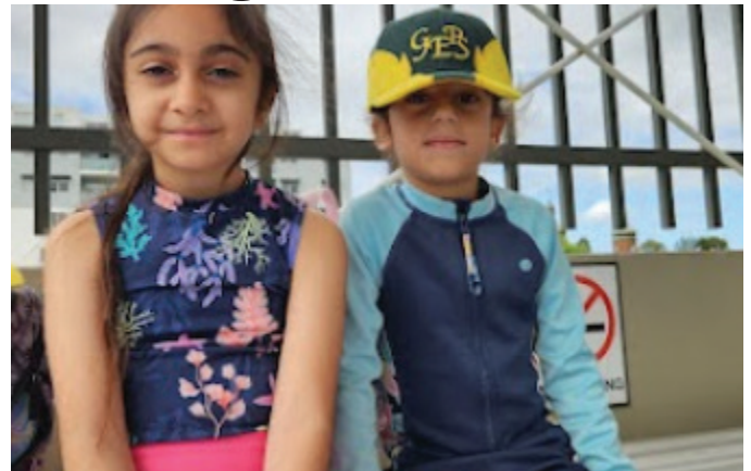
Image: GEPS Students get ready at the Swimming Carnival

Here is what GEPS students and teachers had to say about it.