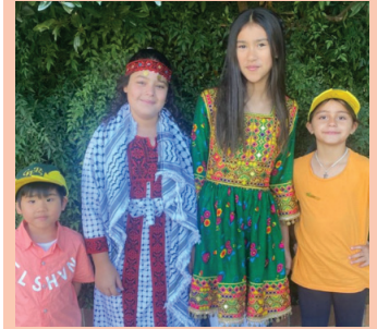
Image: Students don cultural dress or orange