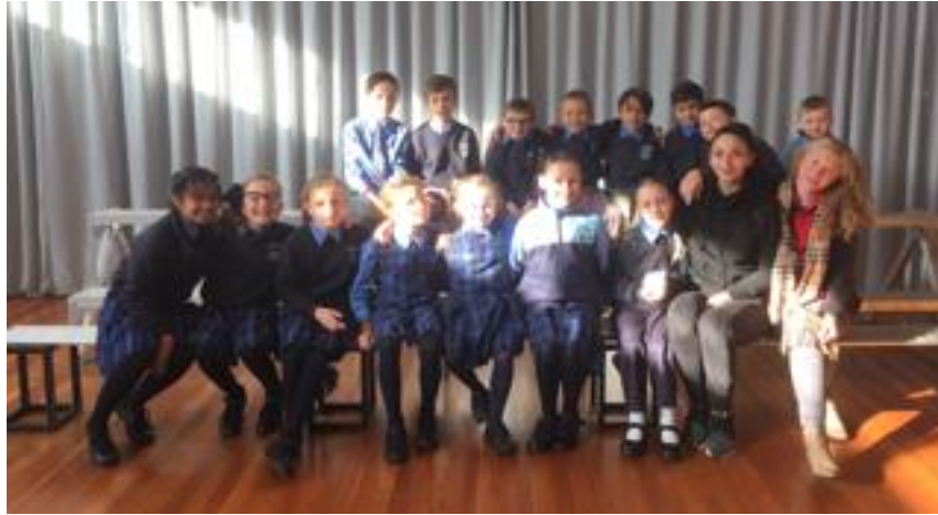
Thursday Before School Care

School photo day, I asked the photographer to borrow his bench for our own picture.