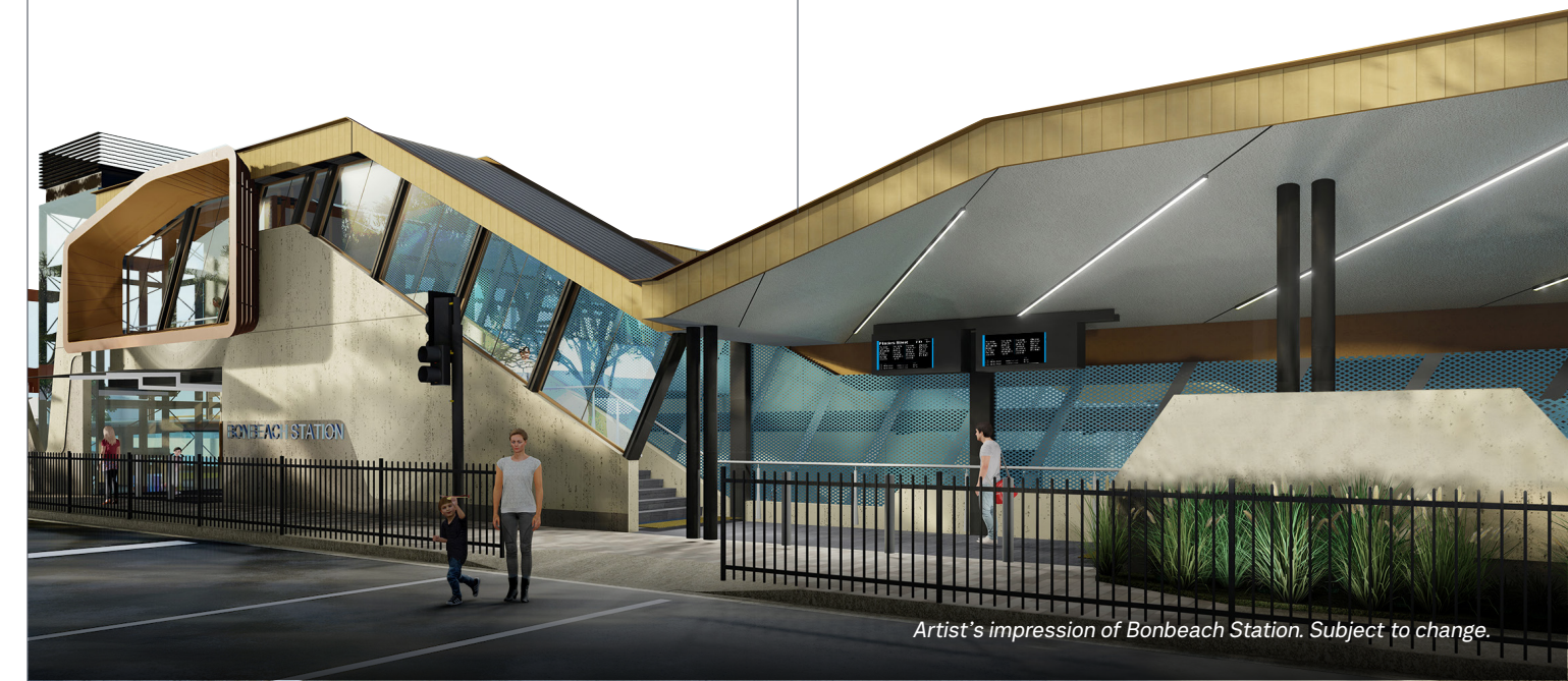
Artist's impression of Bonbeach Station. Subject to change.

For more information on coronavirus, visit coronavirus.vic.gov.au