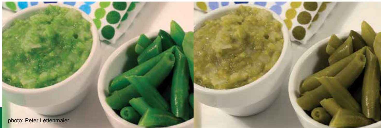
Some foods, particularly green vegetables, can look repulsive to colour blind children.