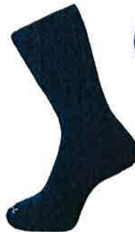
Sock Crew Navy 2pk