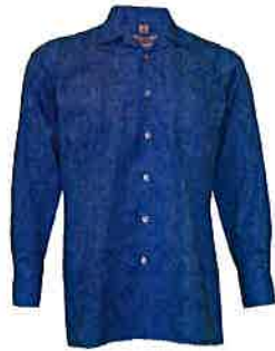
Shirt Open Neck Lng Slv Blue