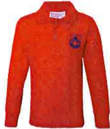
Sports Polo L/S