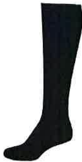
Knee High Sock Navy