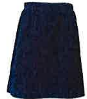
Sports Skort Navy