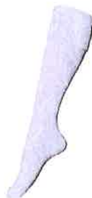
Knee High White 2 pkt