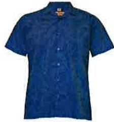
Shirt Short Sleeve Blue