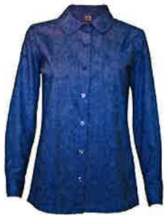
Peter Pan Blouse Lng Slv Blue