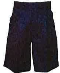
Shorts Fly Front Navy