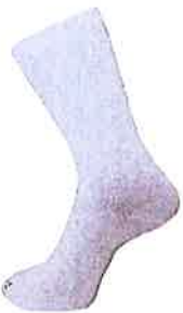
Sock Anklet White 2 pkt