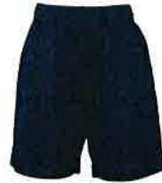
Sports Shorts Navy