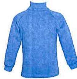
Skivvy Sky Blue