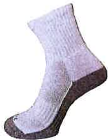
Sport Sock 2 pkt

For current prices, please refer to www.bobstewart.com.au