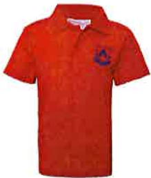
Sports Polo S/S