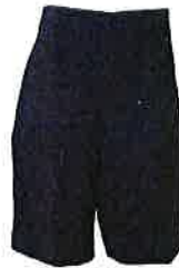
Shorts Elastic Back Navy