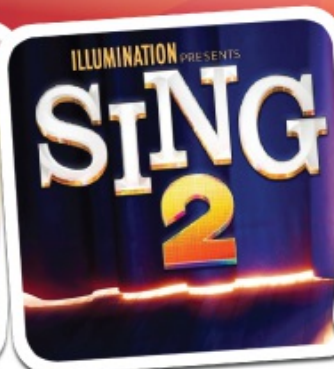
At the Movies