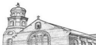
Our Lady help of Christians