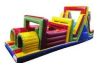
Ultimate 12m Obstacle Course

Bounce your way through the inflatable obstacle course and challenge your friends! Who will make it to the end in the quickest time?