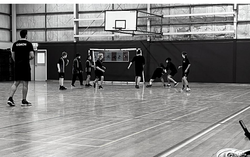
SEED Basketball Training Session in Action