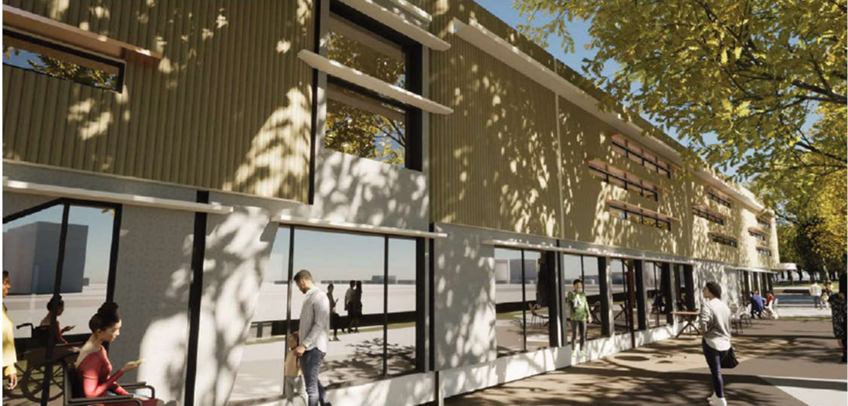
Artist impression shown