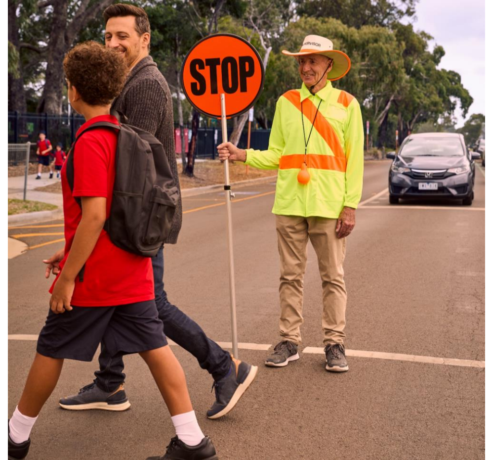
▲ IMAGE: School Crossing Supervisor holding stop sign for student and parent to cross the road with a car stopped behind.