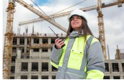
Careers With STEM Job Kits

Information technology, engineering and design are merging into new and exciting career areas improving our cities and communities. Here's how to get skilled up and land a job, https://bit.ly/2N3eRsw