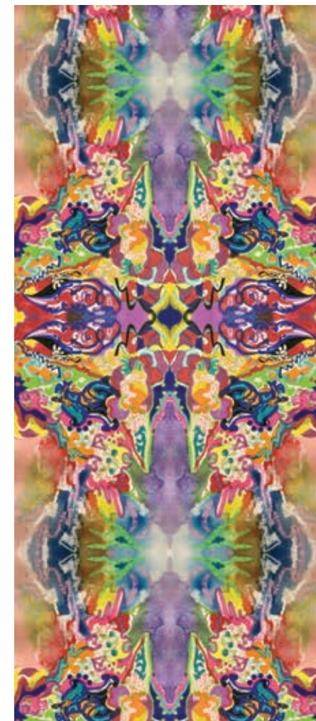
Camouflage Shanshan Chen