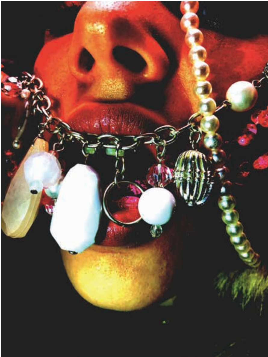
Beauty of Despair Annabelle Blount