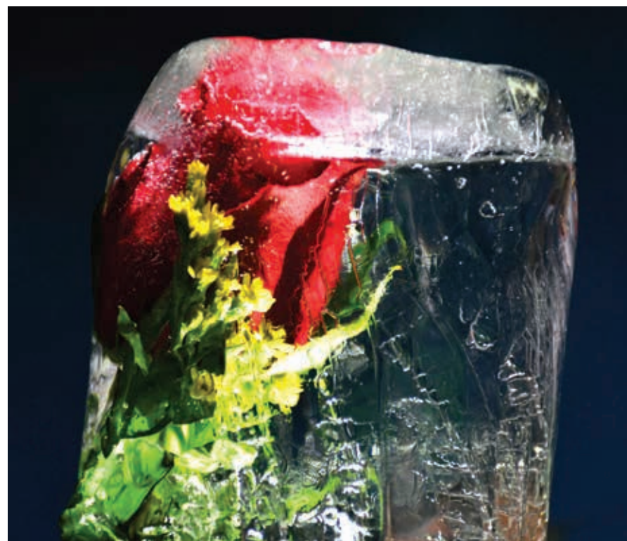
Student Art Work Tiffany Hume Y6