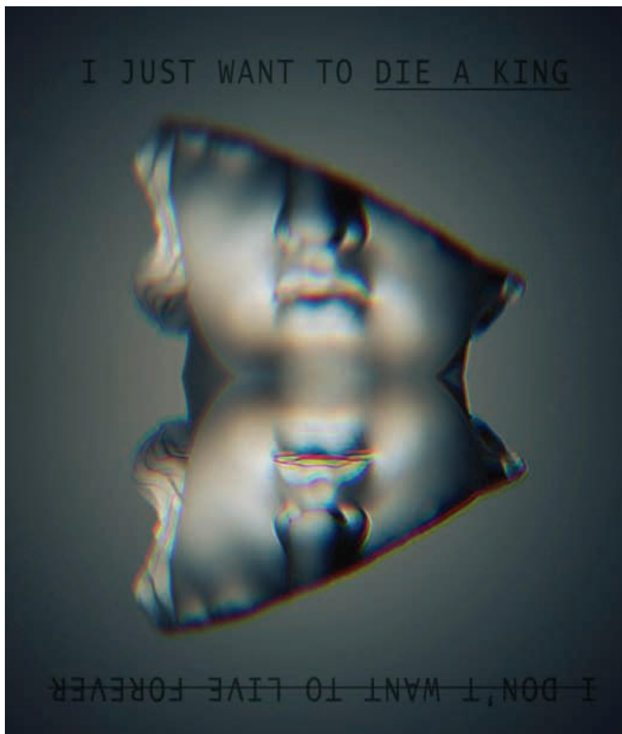
Student Art Work Mojmír Čalkovský Y6