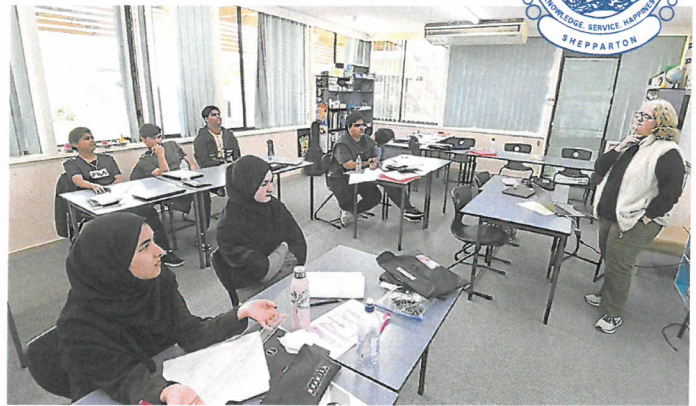
Shepparton English Language Centre is a safe place where individuals from diverse backgrounds and cultures unite.