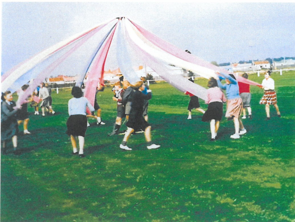
Students dancing around a maypole.

IMAGINE A BOOK WITH A GILDED COVER FILLED WITH BOUNDLESS PAGES BRIMMING WITH HISTORY, MILESTONES, VIBRANT COLOURS AND GLORIOUS PICTURES.