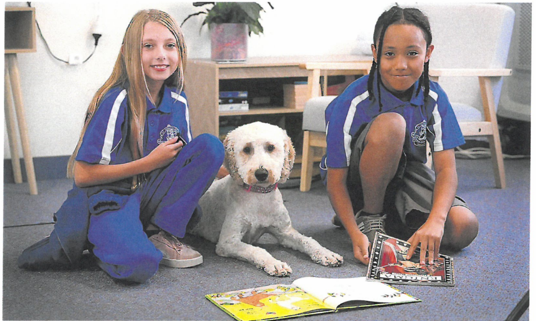
Students are embracing the knowledge they gain through the science of reading program.

"I've heard them say things like, I'm really learning something. They say that they know