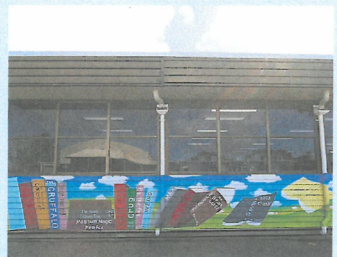
Tank from Tank Art has been a huge part of the wonderful murals that are on show all year round at the school.